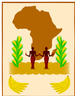
1928 Prayer Book Service

The next meeting of the International Outreach Committee will be December 15 th . Please join us!